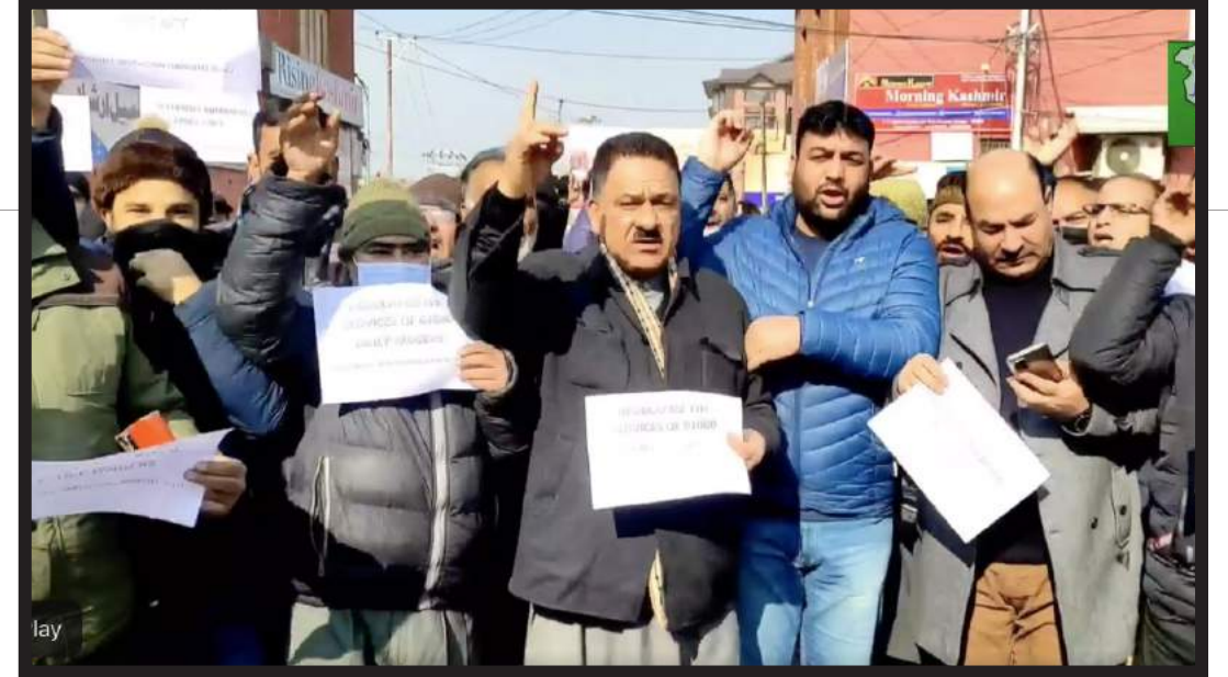
The Employees Joint Action Committee protesting at Press Enclave Srinagar for minimum wages and regularisation of 61,000 daily wagers working in various different departments of Jammu and Kashmir government

Wailing Mothers, Crying Families Essential To Satisfy Their Appetite