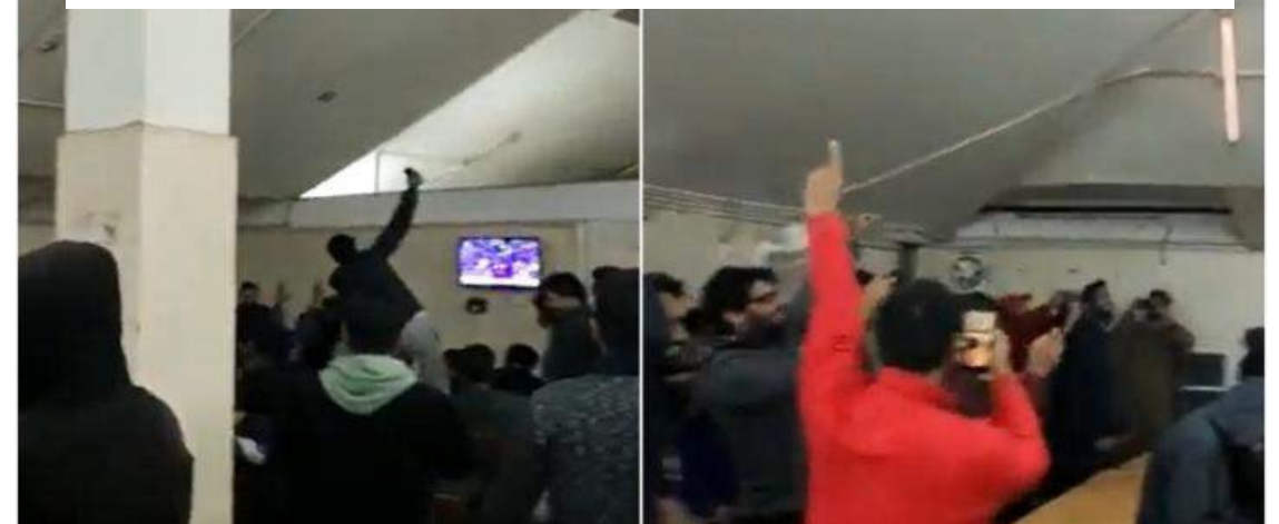
Celebrations following the India-Pakistan match emboldened the secessionist elements in Kashmir to emerge

The decision of the state to overlook all transgressions had a deep impact on the collective psyche in Kashmir. The impact has been deep and lasting. The policy of the state to ignore all errors has led to a social impact where everything is taken as a matter of right. Sedition is regarded as a matter of right. Discrediting the state and its institutions is taken as a matter of right. Going against the state