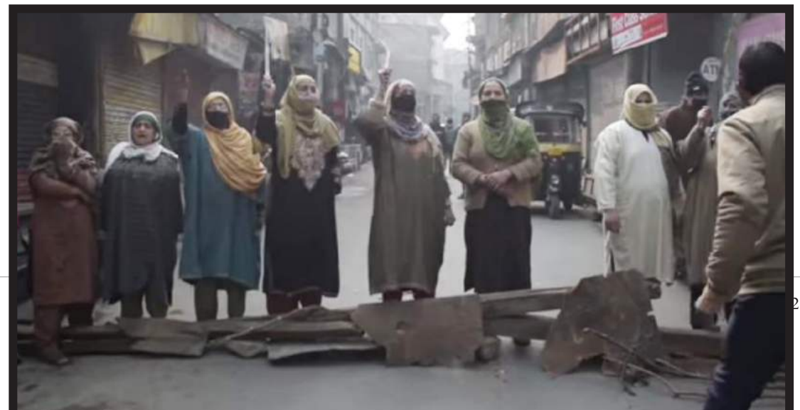
Women of Chinkaral Mohalla in Srinagar protest unscheduled power cuts, say their children are not able to study properly