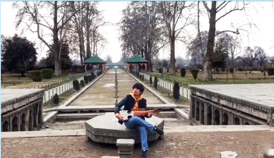
Me And My Rabab

Your window to news, views, exposes, scoops and exclusive features that bring to you KASHMIR