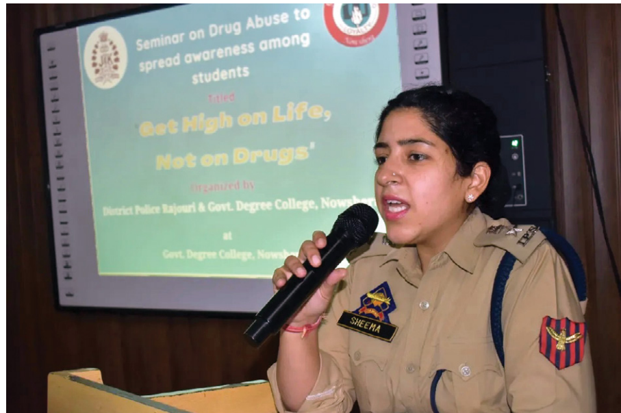
Rajouri police organises seminar for drug abuse at Nowshera

I remember the first time I watched the movie Udta Punjab , which showcased the problem