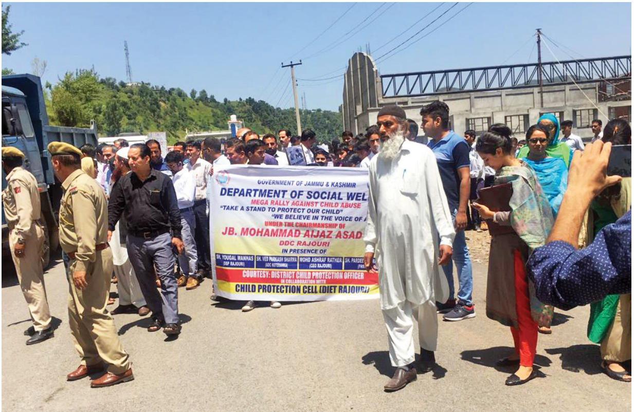
An awareness rally on child protection and drugs abuse organised by the District Institute of Education and Training, Rajouri

Police are not working responsibly and efficiently in fighting drug abuse. He said that when the police file a challan under The Narcotic Drugs and Psychotropic Substances (NDPS) Act, they deliberately leave many lacunas so that the accused can get away.