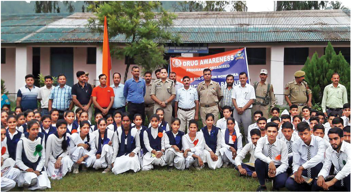
District Police Office, Rajouri holding an awareness lecture on drug abuse in Lamberi school

Jammu and Kashmir is facing the brunt of narco-terrorism. JK Police, the Army, the para military forces – all of them have declared war over drugs. But fighting this war is difficult for them because of the high level of involvement of people. There is also lack of support from people, who wish to earn easy money by helping the drug lords. Kashmir Central has highlighted the abuse of narcotics in the area of Kashmir. I decided to write on the problem of narcotic abuse in the area of Pir Panjal. It is a matter of alarm that drug abuse in this area is increasing.