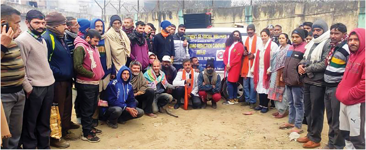
Social Welfare Department under the campaign 'national drug demand reduction campaign.' organised a nukkad natak to sensitise people about drug abuse

police don't go into the details regarding a case.